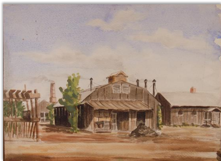
Above: Mess hall with gardens, 1942–1945, watercolor.

Butler Center for Arkansas Studies at the Central Arkansas Library System, uses artwork and documents created during the wartime incarceration of Japanese Americans in Arkansas to address themes of identity, community, civil rights, and justice that continue to be relevant today.